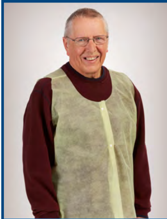
#86395 Patient Vest