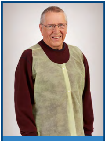
#86395 Patient Vest