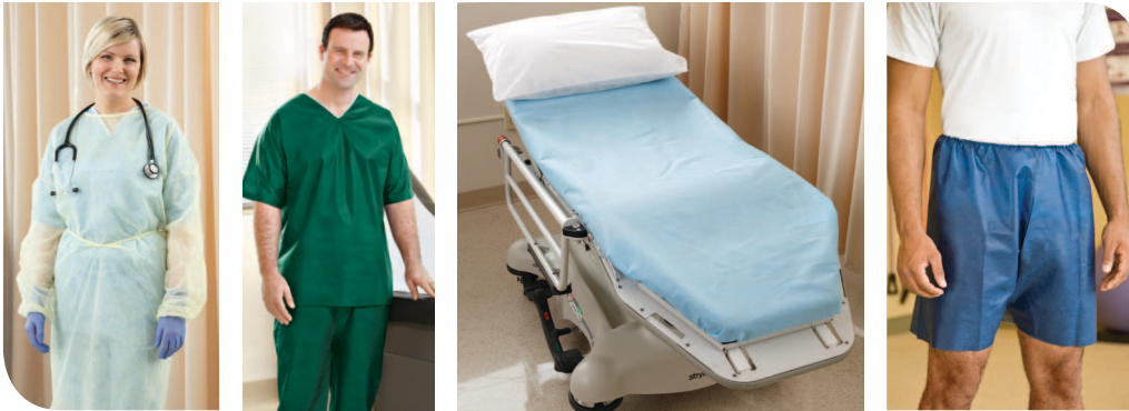
Graham Medical's gowns, scrubs, sheets and shorts are recyclable. Contact us for a full list of products.

Disposables are recyclable and eco-efficient. Our nonwoven, linen-like products can easily be recycled in a #5 polypropylene bin. Plus, our recyclable, single-use products offer eco-efficient advantages over reusable linens that require ongoing laundry services, high-temp water, and end up in a landfill when thrown away.