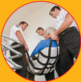
The MegaMover® Transport Chair is ideal for carrying patients in areas of limited space.