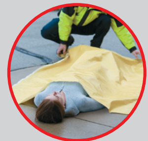
Yellow blankets are generously sized for full coverage and easy identification.