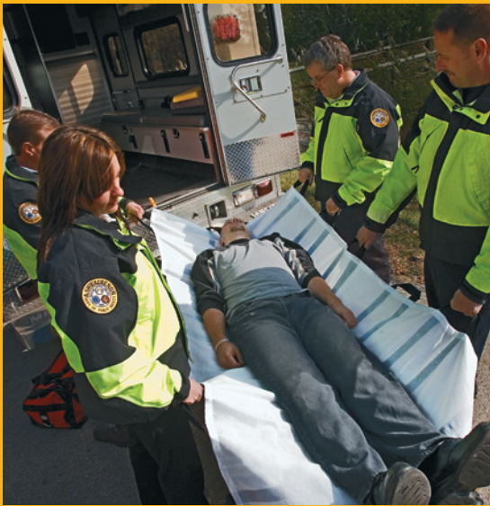
MegaMover® transport units are easy to handle, even in the most rugged terrain. Shown here is the MegaMover®.

Our innovative patient rescue and transport units go where stretchers cannot. Graham Medical's design features a fluid barrier and vertical nylon straps for added strength and versatility.