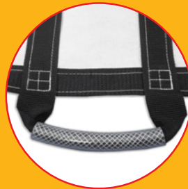
Also available with new and improved PowerGrips™ for added comfort and durability.