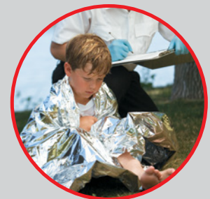
Lightweight Hypothermia Blanket retains patient's body heat.

Hypothermia Blanket is a lightweight, insulating mylar (metallicized polyester) blanket that functions as a wind and moisture barrier to retain your patient's body heat.